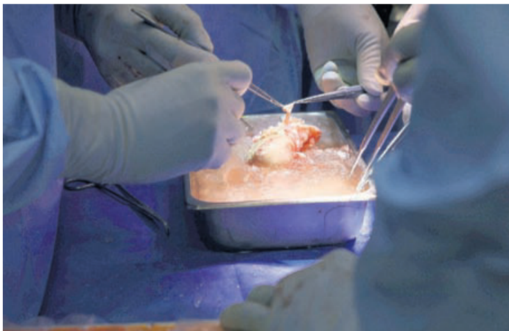
A pig kidney sits on ice, awaiting transplantation into a living human at Massachusetts General Hospital, Saturday, March 16, 2024, in Boston, Mass.